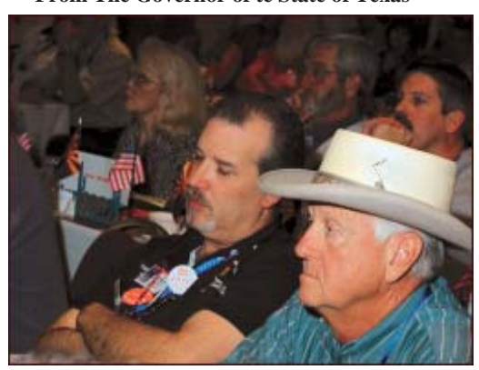
He might be sleeping But I'm paying attention