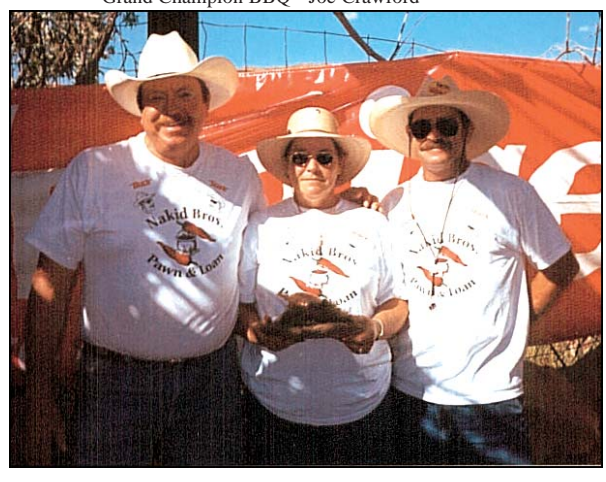
Bronze Buzzard Cookoff 1st Show - Nakid Bros Pawn & Loan