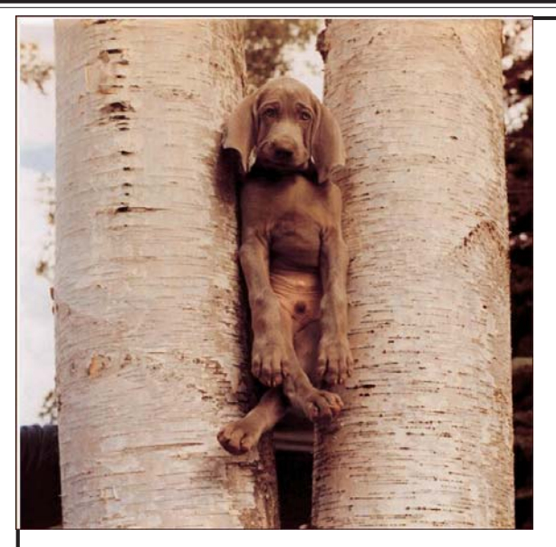
Some days we just get stuck and bogged down. Some days all you can do is smile and wait for someone to kindly remove your butt from the hole you find it wedged into.

CASI Cookoff Promoters New Place to send Upcoming Cookoff Info Effective Immediately