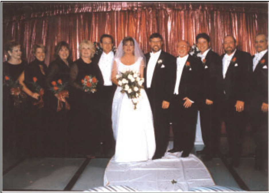
The Wedding Party