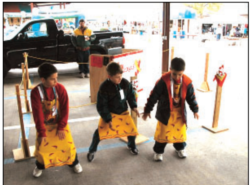
The Hotties - Junior Show - CyFair 2003