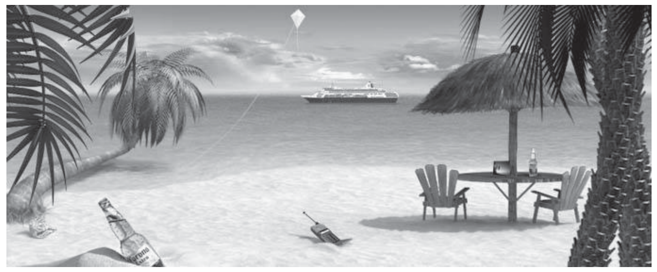
Corona and Glazer's Distributors Proud Sponsors of CASI