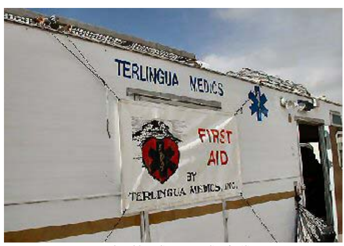
The old Terlingua Medics facility